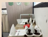
By Eliza and Bella